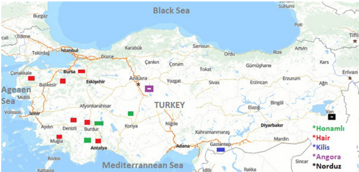
Figure 1. Locations of samples collected during the experiment in Turkey (Hair, Honamlı, Kilis, Angora and Norduz goat). The map should be downloaded from the Republic of Turkey, General Directorate of Mapping and the related reference should be given here as a footnote.

Primer sequences of KAP1.1 F: 5'-CAACCCTCCTCTCAACCCAACTCC-3', R: 5'-CGTGCTACCCACCTGGCCATA-3' [10], KAP1.3 F: 5'- CAAGCAGACCAAACCTCAGAAAC-3', R: 5'-TGTCACAGTAGGATGGGCGGC -3' [16] and K33