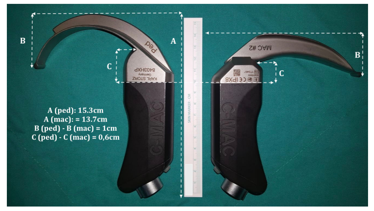
Figure 1. Visual comparison of the two blades. Differences in the design, angulation, and length of the blades are shown.

All children underwent inhalational induction with 8% sevoflurane in a mixture of 66% nitrous oxide and 33% oxygen. A neuromuscular relaxant was routinely administered (rocuronium 0.6 mg.kg-1). The anesthesiologist waited for at least 3 min after rocuronium administration to ensure adequate laryngeal relaxation. All intubations were performed using an uncuffed endotracheal tube, shaped with a stylet related to the blade used, after the appropriate size of semirigid foam neck collar (Philadelphia cervical collar) had been positioned around the patient's neck according to the manufacturer's recommendations. Each laryngoscopy was scored using the modified Cormack-Lehane System (MCLS) [9]. This 5-grade scoring system involves the subdivision of the original grade 2 into 2A (partial view of glottis visible) and 2B (only the arytenoids visible). Intubation time was measured from raising the laryngoscope to the mouth above the teeth until confirmation of intubation. visualization of end tidal carbon dioxide (ETCO2), and chest expansion. Patients' pre and postintubation blood