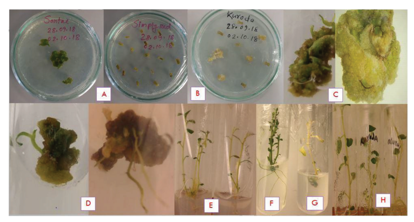
Figure 1 . The different step of selection, callus induction, regeneration and plantlet production on regeneration selection medium. A. Bombarded explants on selection media (leaf and internodes). B. Blackish discoloration of nontransformed explants denotes its decayed condition because of selection pressure, initiation of callus formation from transformed explants. C. Fully developed mature calli. D. Emergence of microshoot from calli. E. Multiplication and culture of microshoot with presence of selective agent. F. Second round of selection where spectinomycin resistance shoots were capable to create roots against selection pressure. G. Died of nontransformed shoot because of selection pressure and there is no root was formed. H. Spectinomycin resistant and PCR positive transplastomic shoots.

shoot formation was noticed from those embryogenic cells, and the number of transplastomic candidate shoots were recorded. Three cytokinins (TDZ, TR and TZ) showed various responses in cases of shoot regeneration proficiencies and days required. Concerning shoot formation, TDZ produced the highest percentage of shoot formation (41%) requiring 49 days, whereas TR resulted in 40.3% shoot formation within the same number of days. TZ's shoot production ranges were recorded as 17% to 39.6% within 49 days (Table 2). Shoot production proficiencies also varied depending on cultivar types. Cultivar Kuroda and Sante produced a higher number of shoots, whereas cultivar Kuroda and Challenger respectively yielded the lowest number of shoots. The transformation efficiency was calculated after six weeks. The bombarded explants of different cultivars showed varying responses on regeneration media containing selection agent (Table 2). After that, the total number of shoots produced by every cultivar was calculated and recorded. Cultivar Sante and Challenger 9.6% shoot regeneration efficiency (%) followed by cultivar Simply Red (8.8%). On the other hand, cultivar Kuroda produced the lowest (6%) shoot regeneration efficiency (Table 2). Proliferated shoots were subcultured for several rounds of selection to achieve homoplastomic condition on MS media supplemented with 50 mg/L