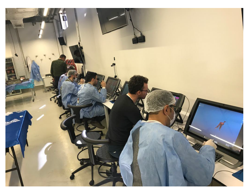
Figure 3. Talent test.