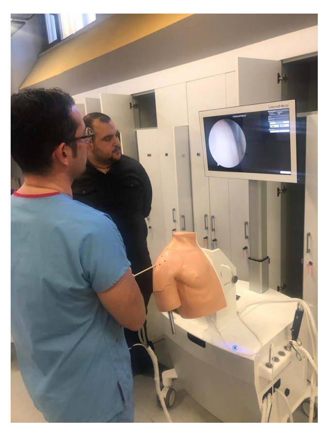
Figure 4. Theoretical and practical educational methods and alternatives for them during and after the pandemic